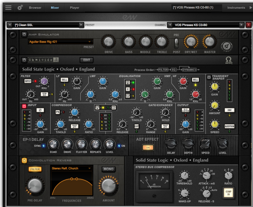
Amongst Play's effects options, the EP-1 Delay and ADT Effect are new for Voices Of Soul.

Two of the effects modules — the EP-1 Delay and ADT Effect — are both unique